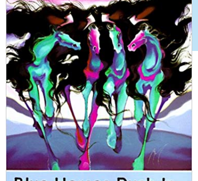
Blue Horses Rush In Luci Tapahonso